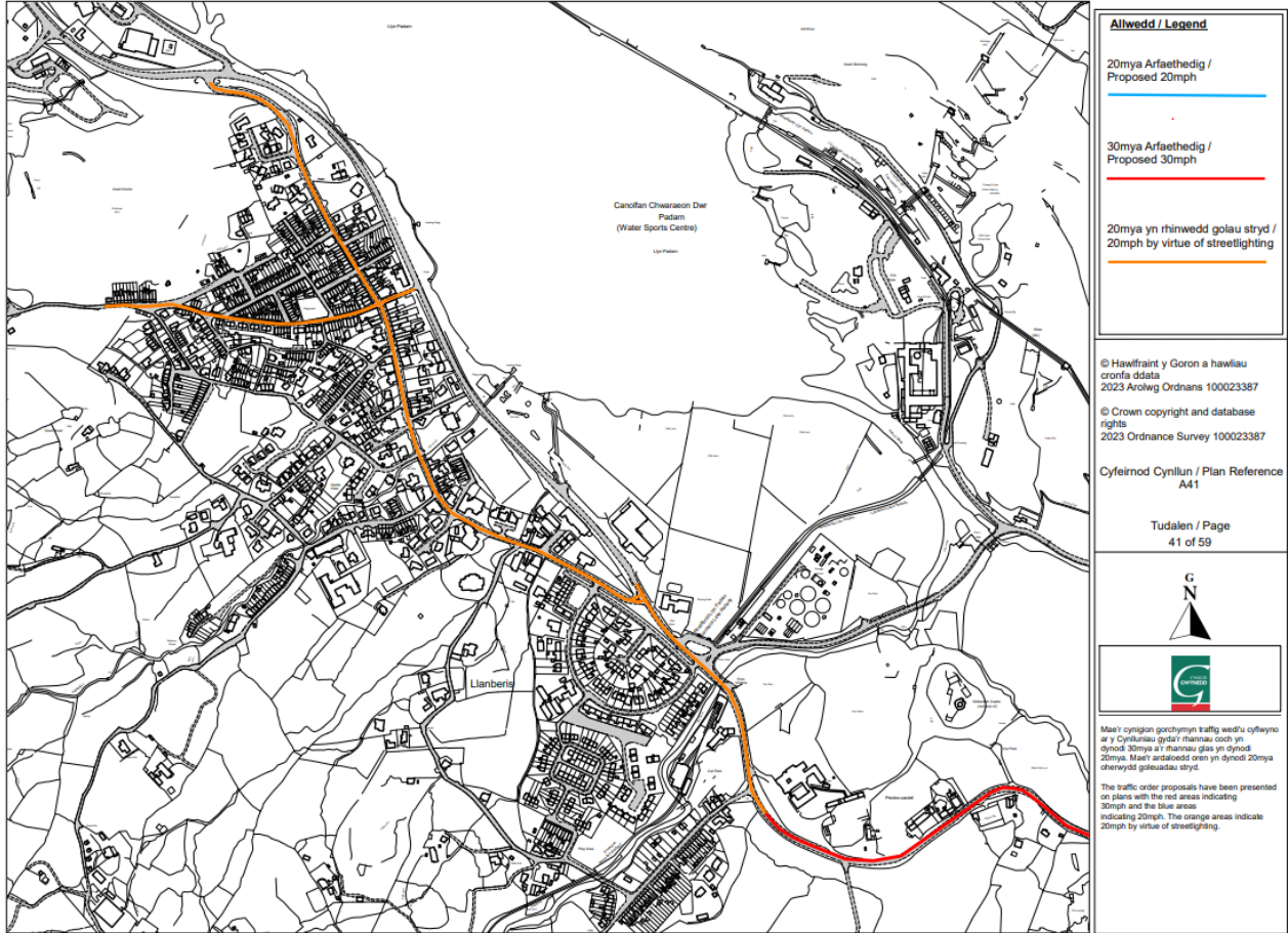
Llanberis - Pentre Castell